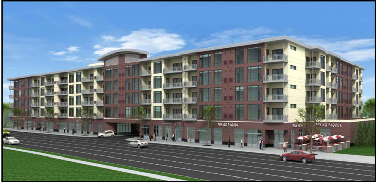
Studio One Plaza-Woodward View