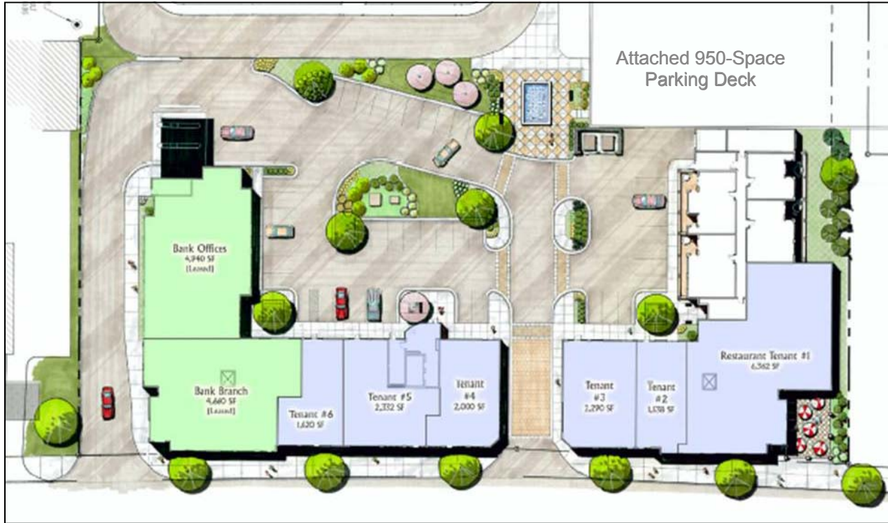
Studio One Plaza-Retail Site Plan