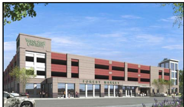
Attached Parking Garage